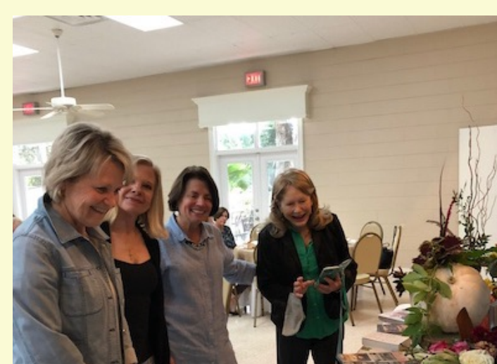
Guests admire Sisterhood of the Traveling Plants Designs and table decorations by club members.